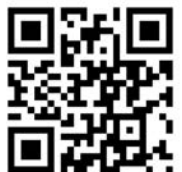
Video Leg locking system